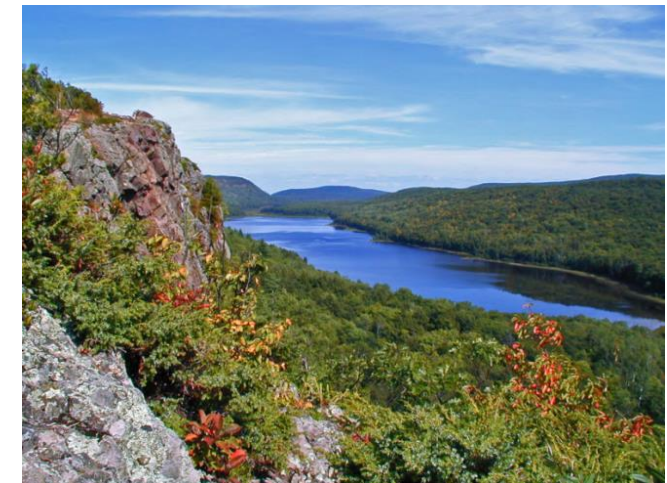
Lake of the Clouds, Porcupine Mountains Wilderness State Park.

The bustling community of Nonesuch, a copper mine that operated sporadically from 1866 until 1912. The site became part of Porcupine Wilderness State Park Ontonogon, Michigan